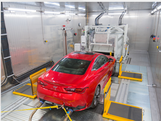
>> 4WD chassis dyno with altitude capability